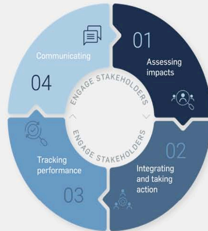
THE HUMAN RIGHTS DUE DILIGENCE PROCESS

According to the ILO Tripartite Declaration of Principles concerning Multinational Enterprises and Social Policy (MNE Declaration), the due diligence process, as it concerns workers' human rights, should "involve meaningful consultation with potentially affected groups and other relevant stakeholders including workers' organizations". 21 According to the MNE Declaration, this process should "take account of the central role of freedom of association and collective bargaining as well as industrial relations and social dialogue as an ongoing process". 22